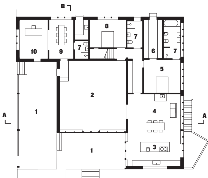
ground floor plan